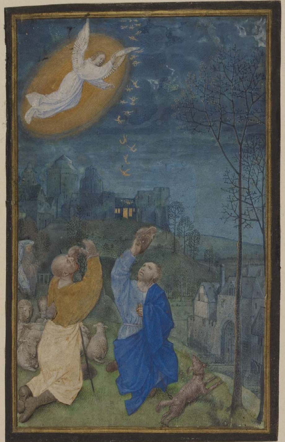
Master of the Houghton Miniatures, The J. Paul Getty Museum, Los Angeles, Ms. 60, recto, UBP